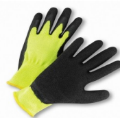
Gloves $3.50 Pair