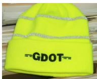
Hats $6.50 Each