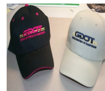
GDOT HATS $12.00 Each